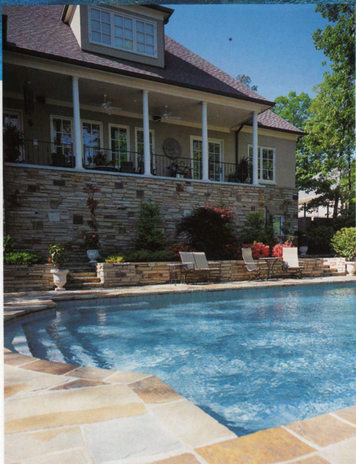
Perfect for summertime get-togethers, the Landers' pool area is highlighted with natural-stone decking, blooming plants and an array of outdoor furnishings.

To further enhance the casual elegance of the pool area, Norman designed an enchanting natural-stone fountain, which features a stately lion's head flanked with large urns. Landscaped with a verdant mix of tropics, perennials and annuals by Kevin Grisham of Growing Concerns, the end result is a natural retreat that allows the Landers to get away from it all without ever leaving home.