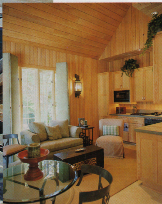
JASON MASTERS, NOLA STUDIOS

A reupholstered love seat and burlap-covered chairs provide comfortable yet refined seating in the greatroom, which is outfitted with a full-service kitchen to simplify poolside entertaining.